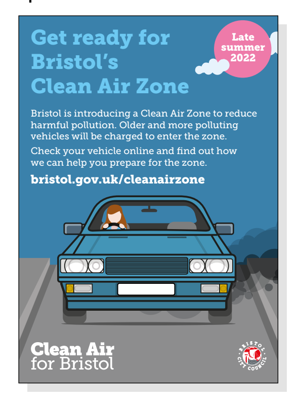
A4 downloadable poster